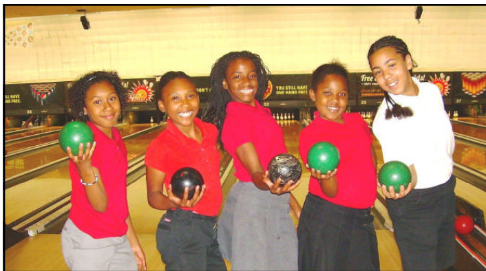
Fifth graders have fun at the AMF Westview Lanes in Catonsville for duckpin bowling at the end of the school year.