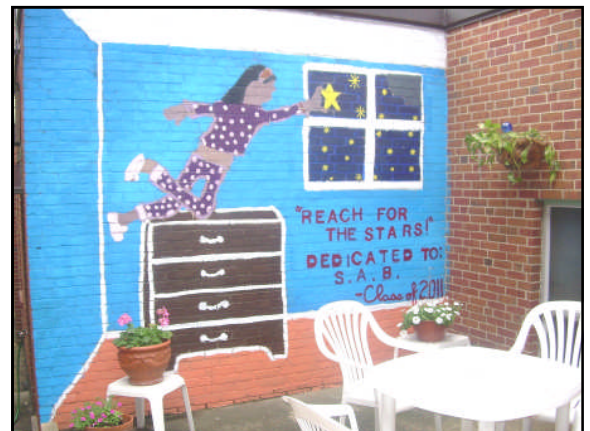
The Class of 2011 created the mural for the refurbished courtyard and garden.

Another five students took responsibility for painting a colorful mural on one of the brick walls facing a small patio outside the cafeteria. After traveling to see murals at various sites in the city, the group developed a sketch of a girl looking out her bedroom window at night. They worked with chalk to outline the sketch on the wall using the correct dimensions. After mixing paints to get the desired colors, they slowly filled in the sections. Lastly, the girls painted letters for the dedication which encourages Academy students to “Reach for the Stars.”